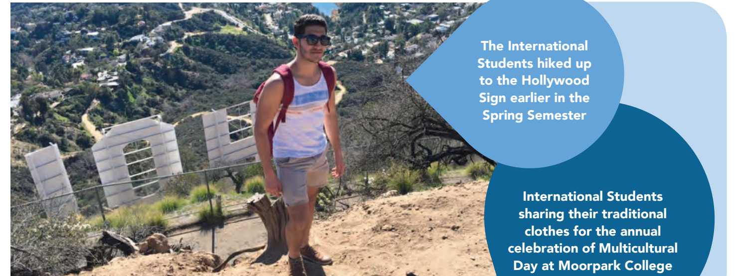
The International Students hiked up to the Hollywood Sign earlier in the Spring Semester