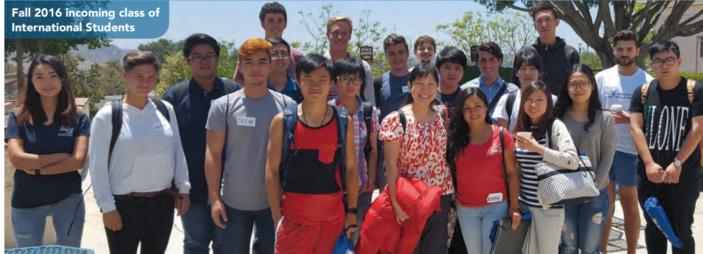
Fall 2016 incoming class of International Students