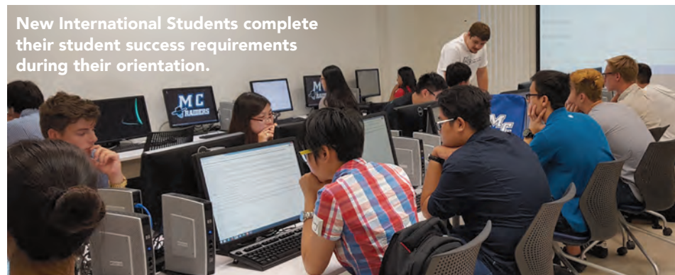
New International Students complete their student success requirements during their orientation.

By the end of the day, students received a campus tour to introduce them to the services available on campus.