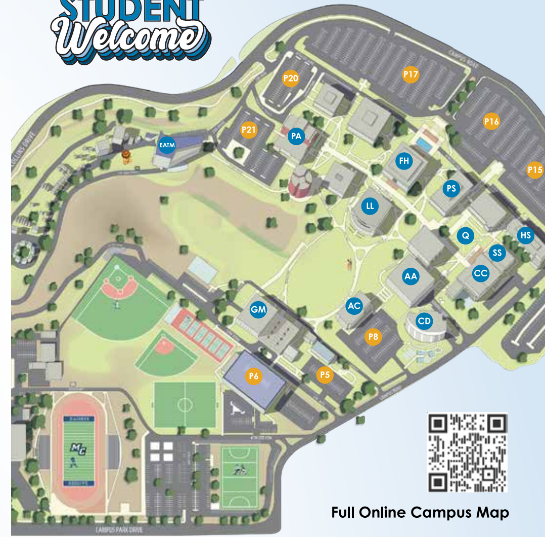
Full Online Campus Map